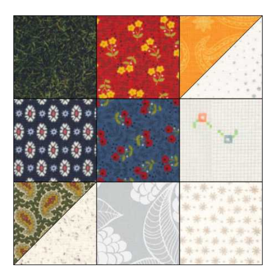
Block – 12-1/2-inches – A high contrast between dark and light works best. Medium value prints should be avoided. Patches are 4-1/2-inches. Scrappy looks best with lots of blocks, try to mix up colors and prints in every block.

Setting Design Ideas – Some ideas, there are many more ways to assemble this quilt.